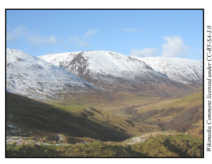
FIGURE 2. The parallel roads of Glen Roy, Scottish highlands, outlined by a recent snowfall, 10 March 2009

Although Darwin's only degree was in theology, he discovered uniformitarianism in the early 1830s on his voyage aboard the Beagle , when reading Lyell's Principles of Geology . It revolutionized his thinking and inspired him to study geology. This relationship between